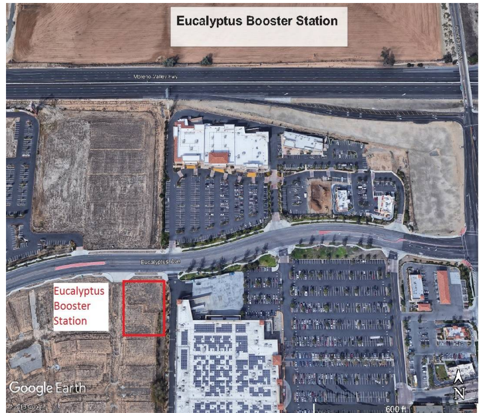
Project Location in Moreno Valley